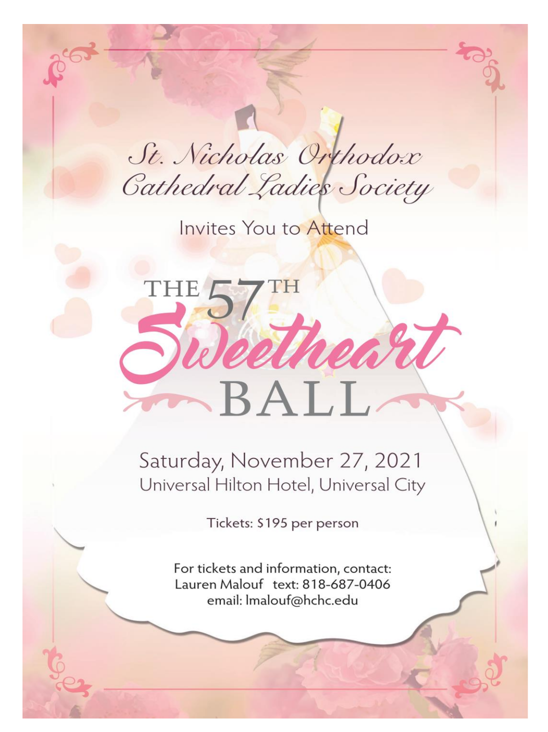
Please sign up during coffee hour today!