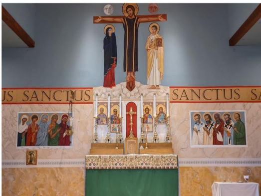
St Michael Orthodox Church in Whittier CA

Hosted by St Michael Orthodox Church, Whittier CA www.orthodoxwest.com/conference