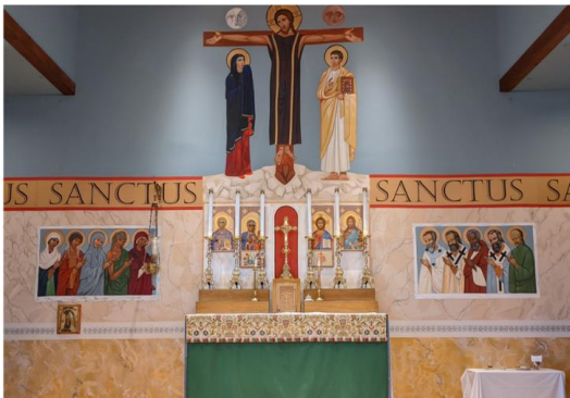
St Michael Orthodox Church in Whittier CA

Hosted by St Michael Orthodox Church, Whittier CA www.orthodoxwest.com/conference