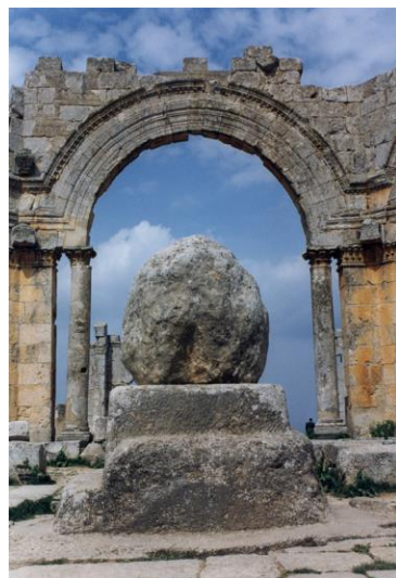
The remains of the pillar of Saint Symeon the Stylite in 2000, before 2016 Russian air-strikes.

He did not adopt this strange way of life out of vainglory, a charge that some of his contemporaries made against him at the first, because he was already famous for his asceticism and holiness before ascending his first pillar (in Greek, style, whence he is called "Stylite"). The Church historian Theodoret of Cyrhus, an eyewitness of his exploits, called him "the great Wonder of the world." God gave